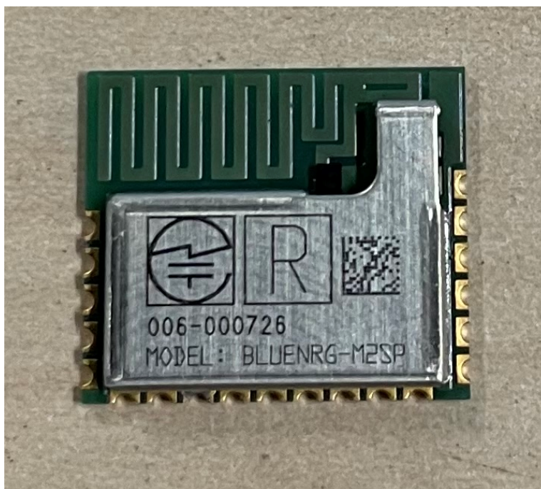
FIGURA 1: BOTTOM